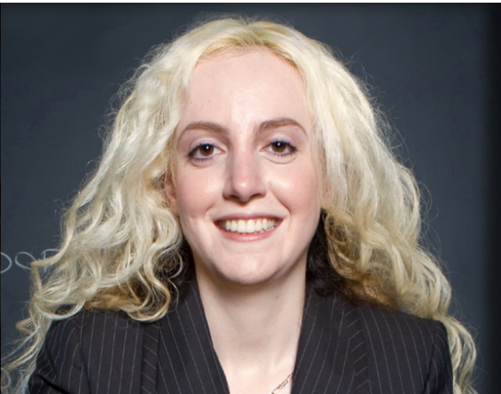
GOLDIE NEJAT ROBOTICS AND AUTOMATION

This allows companies to maintain quality while increasing efficiency and reducing cost.