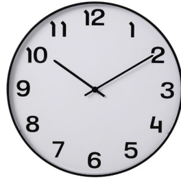
Extra writing time