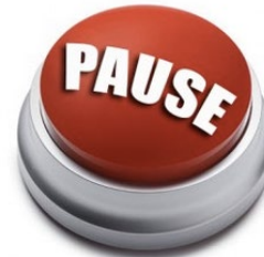
Stopped clock breaks